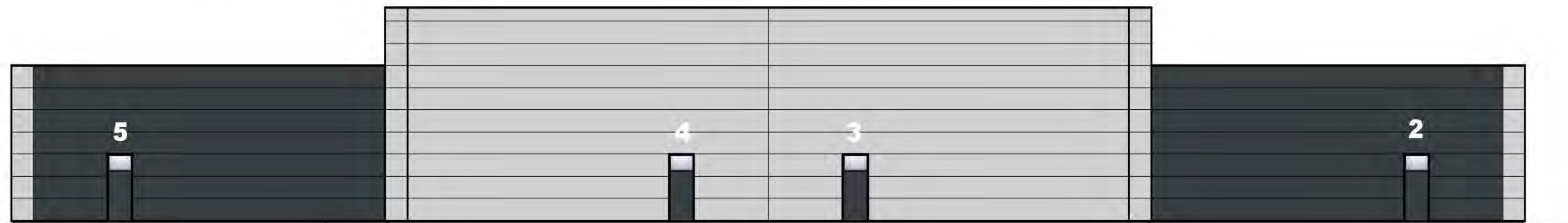
Rear Elevation - Units 3-6